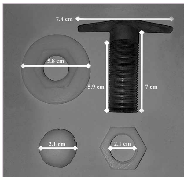
Figure 1. Ileal t-cannula.

The jejunal simple t-cannula (Kremer Precision Machine) was made of stainless steel (Figure 2) and had a wing shaped flange with tapered corners that were 6.2 cm long and 2.2 cm wide at the widest point, and a tubular barrel with an outer diameter of 1.7 cm and an inner diameter of 1.6 cm. The barrel was 6.3 cm long and the external threaded surface was 3.2 cm in length. A stainless-steel washer with