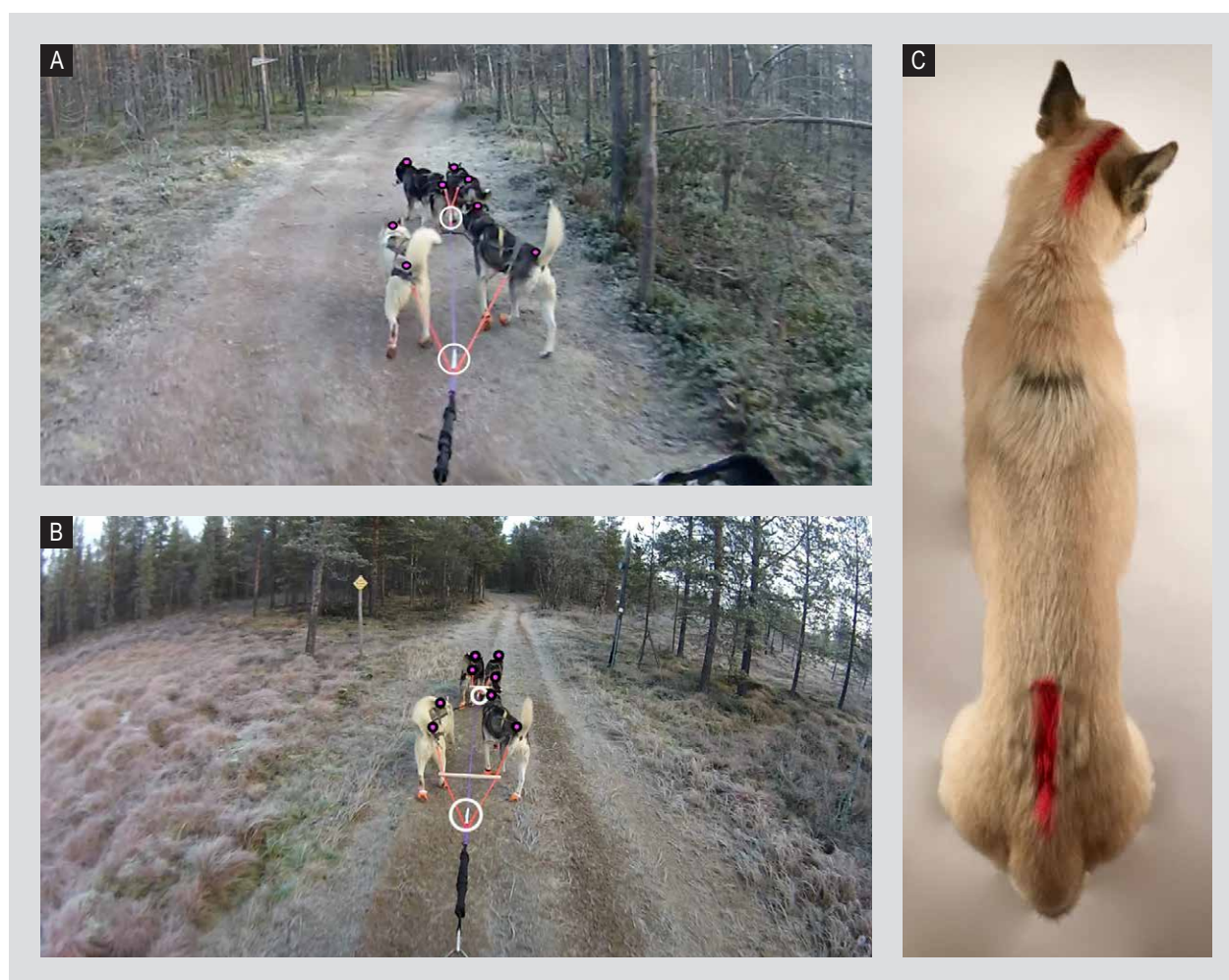
Figure 1. Gang-lines and dogs with markers highlighted. In the middle, the mainline is shown and in a different colour, the tug-lines attached to the dogs. The main line reflective markers circled in white, and dogs' markers emphasised with small black circles. (A) The traditional gang-line set up; (B) the stick gang-line; (C) the colour marks on a dog.

The dogs' work effort is related to the angle of pull. The angle of traction changes the amount of force needed to pull. The more parallel to the direction of the pull the line is, the less force is required to pull. As an example, to open a door with a rope, a dog needs to pull with 44.5 N if the rope is perpendicular to the door (i.e. 90 degrees angle to the door). The force demand rises to 97.9 N if the rope is at a 60° angle to the door (Coppinger et al. , 1998). In a study where a handler sitting in a wheelchair held the tow strap at the side of the wheelchair and instructed a dog to pull, the dog was actually observed to pull in a sideways direction, even though the dog was parallel to the direction of movement (Coppinger et al. , 1998).