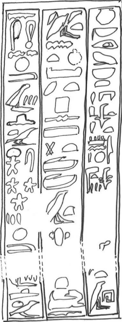
FIGURE 60 Mummy-cover (A.15). Inscription 1