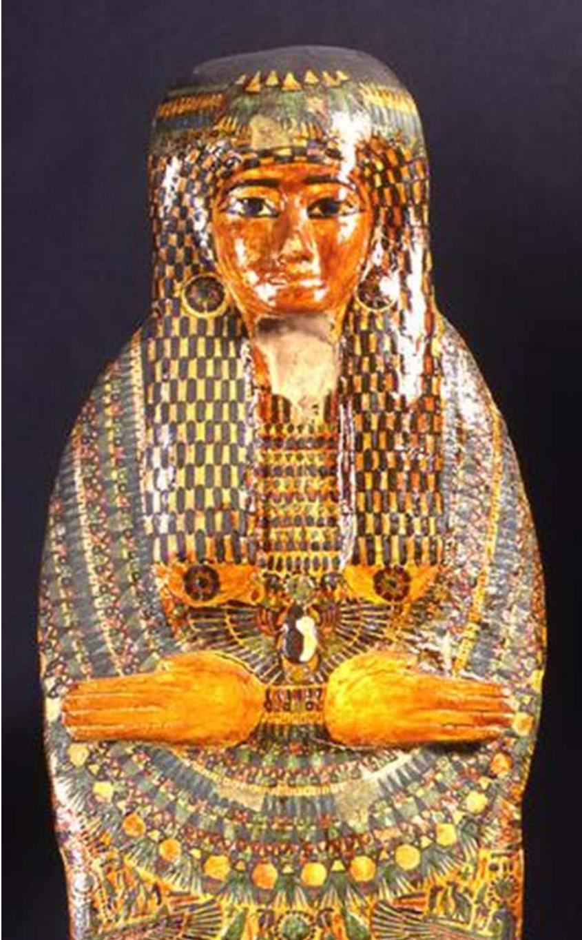
FIGURE 62 Mummy-cover (A.15). Headboard and upper section