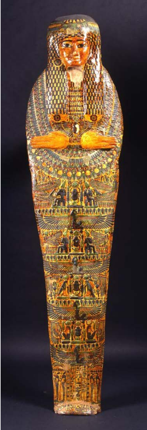
FIGURE 61 Mummy-cover (A.15)