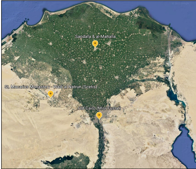
FIGURE 2 Map of key sites in the life of Ibn Rajā'

The life of Būluṣ ibn Rajā' was a mix of suffering and triumph. He endured the persecutions of al-Ḥākim, faced the trial his father brought against him for apostasy, personally witnessed the rape of his concubine, 62 the murder of his son, the theft of his property, and concealed himself from a mob attempting to kill him at the end of his life. From this perspective, we might view him as a victim. But Ibn Rajā' also freely converted from Islam to Christianity, he publicly declared his conversion, he was set free after his apostasy case, he became a Coptic monk and priest, and he was able to write critiques of Islam. He became one of the most famous Copto-Arabic writers of his time whose notoriety shaped later Christian views of Islam, the Qur'an, and Muḥammad. Ibn Rajā's biography demonstrates his remarkable impact on Coptic Christianity and the Fatimid Islamic communities in Egypt. 63