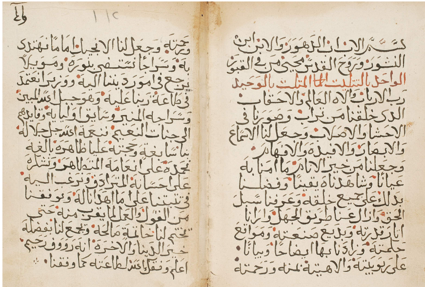
FIGURE 4 MS Sbath 1004 / Salem 202. Syria, Aleppo, Fondation Georges et Mathilde Salem, AR 202 HMML Project Number: GAMS 01004

gion. He elevated it over Judaism 108 and spoke through his own tongue, of the spiritual testimony. So we ask the One who helped him and opened his heart that [God] may guide us as He guided him and direct us as He directed him. Praise to our Lord and King Jesus Christ the Eternal One, forever and ever and unto the ages of ages. Amen.