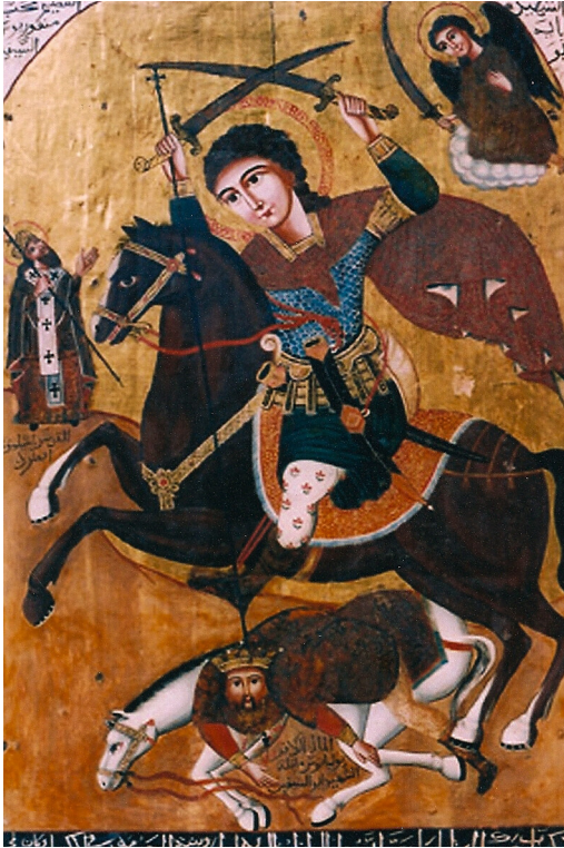
FIGURE 1 Icon of St. Mercurius (Abū Sayfayn), by Yuhanna al-Armani (1778), Church of the Virgin Mary al-Mu‘allaqa, Cairo, Egypt

had the priest translate the Bible from Coptic into Arabic for him, because he felt that he should have a knowledgeable foundation upon which to base his faith, especially because of the suffering he had to endure in giving up everything in his life. 41 Ibn Rajā' began to look at his former life and Muslim beliefs more critically. He used spiritual terms to understand that Satan had sealed his heart, presenting his evil works to him in a favorable light to make him continue to stray in blindness and ignorance. 42 He recognized "the darkness