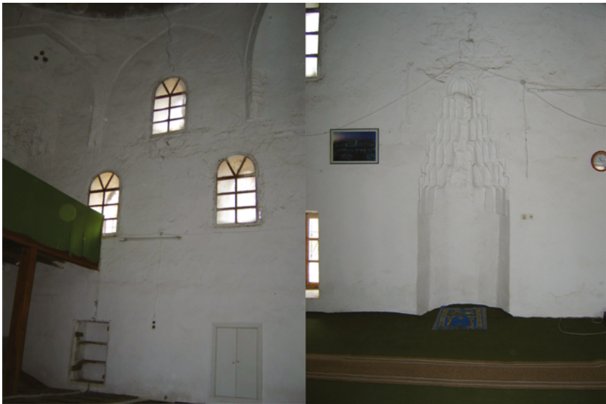
FIGURE 6.6 Interior of Naziresha mosque before restoration in 2005 (left) and (right-Manahasa)

The interior before the restoration, was very poor in terms of decorations, consisting only of mihrab stucco niches and some muqarnas stucco decoration in the squinches (Figure 6.6). After the restoration, the window frames were transformed using a compositional pattern which consists of circular and quasi-elliptical elements and partial bluish and yellowish stained glass (Figure 6.7). The lighting fixture is similar to the Murat Beg Mosque in Kruja, but in the case of Naziresha mosque, it sits better due to its higher inner spatial qualities.