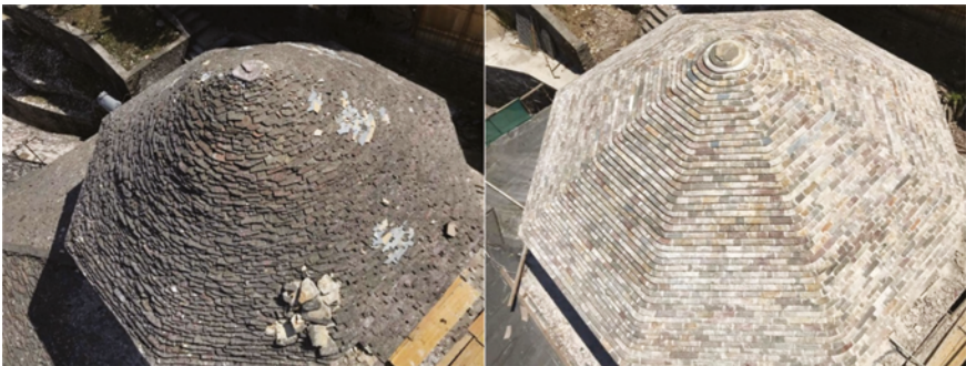
FIGURE 6.28 The dome of the Mosque of Bazar before restoration (left- FMTK) and after restoration (right- FMTK)

plaster was removed from the exterior façades and were left bare. In addition, the joints between the stones were filled with a white grout, giving the wall pattern a totally different visual quality, indisputably different from the original (Figure 6.29).