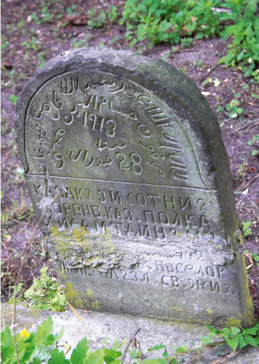
FIGURE 5.10 The Tatar Cemetery in Warsaw – grave of a Russian Muslim soldier (1913) NALBORCZYK