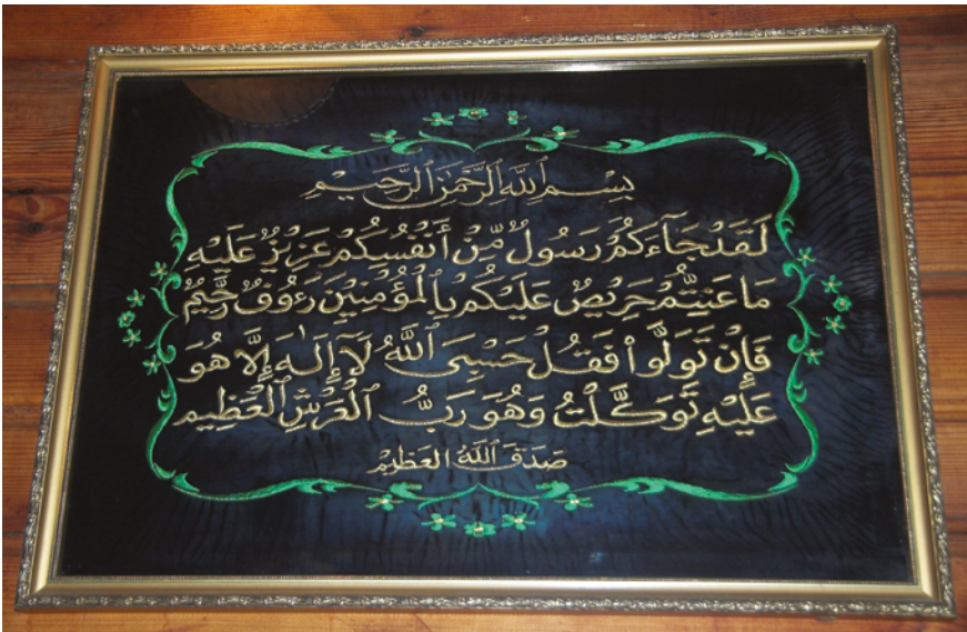
FIGURE 5.4 Kruszyń – Muhir on the wall NALBORCZYK