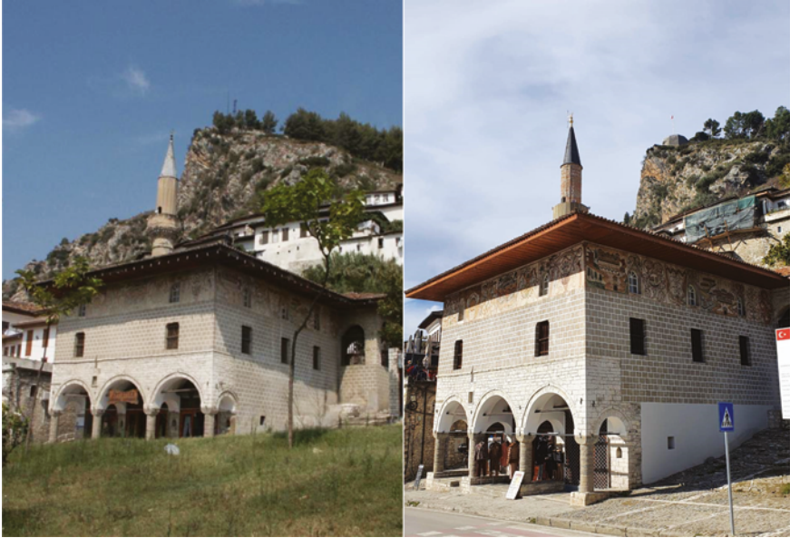
FIGURE 6.20 Mosque of Beqareve in 2005 (left) and after restoration in 2021 (right)