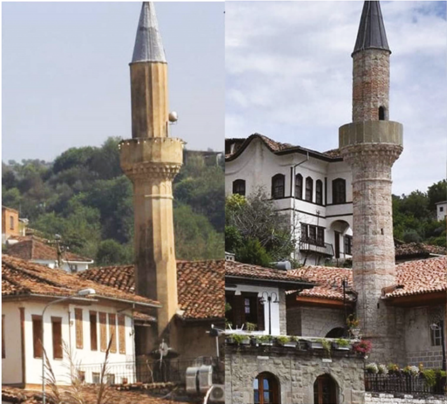
FIGURE 6.26 Minaret of Mosque of Beqareve before (left) and after restoration (right-Joni Margjeka)