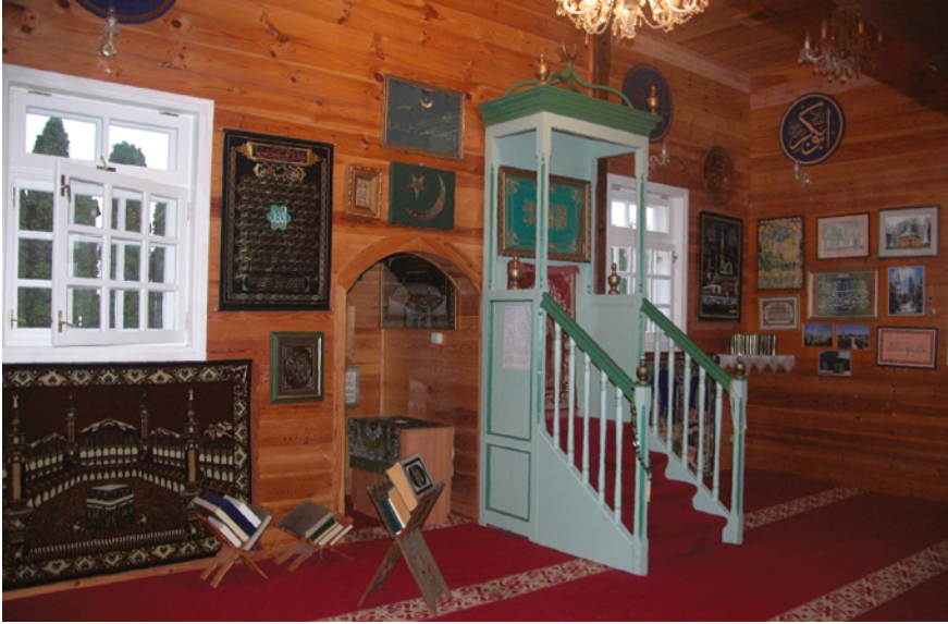
FIGURE 5.7 Bohoniki – the interior of the mosque NALBORCZYK