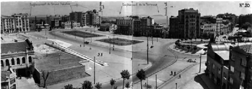
FIGURE 1.6 The making of a square: Taksim