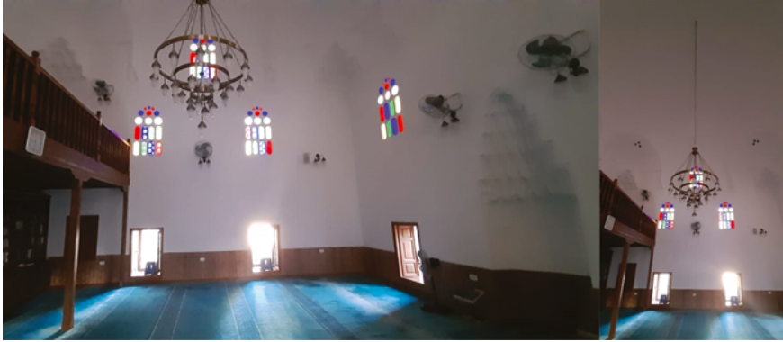
FIGURE 6.7 Interior of the Naziresha mosque after the restoration in 2021 (Manahasa)