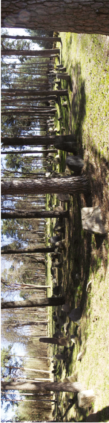
FIGURE 5.12 Kruszymany – mizar (cemetery) NALBORCZYK