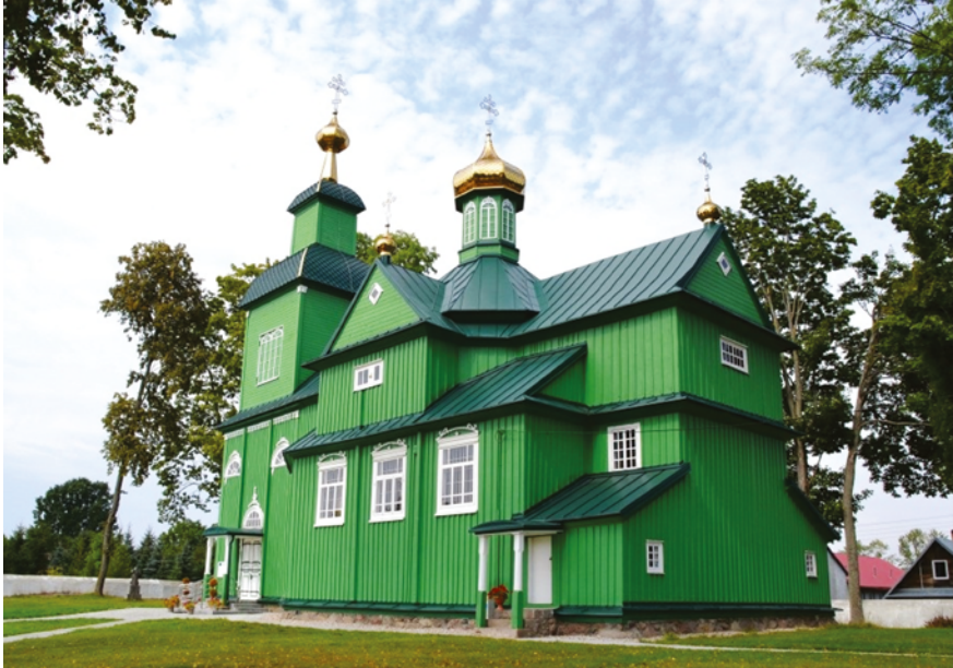
FIGURE 5.5 St. Michael Archangel Orthodox church in Trześcianka (1867)