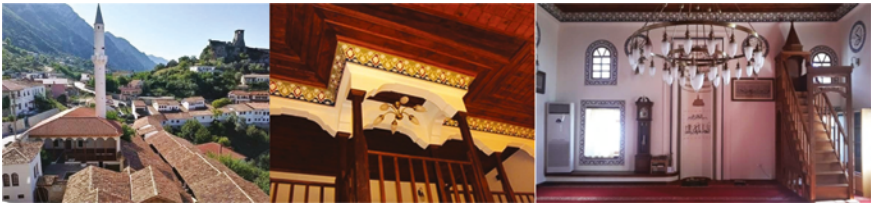
FIGURE 6.4 Image of the mosque after restoration (left), decoration at the women's mahfel (middle) and interior of main prayer hall (right-KMSH)

with the mosques of Beyazit II and Beqareve in Berat. It is of considerable size and includes a prayer hall and a last prayer hall. Its minaret was demolished during the cultural revolution in 1968. After the 1990s its minaret was reconstructed. However, the new one appears to be higher and is made of reinforced concrete and white-washed plaster (Figure 6.3).