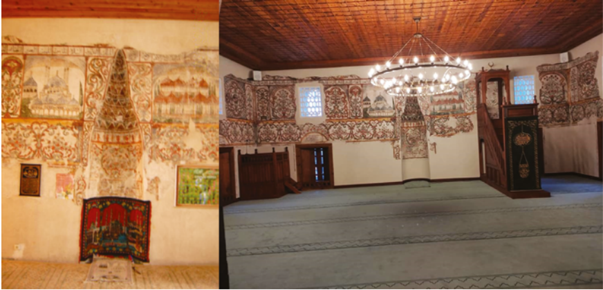
FIGURE 6.22 Mihrab image in 2005 (left) and after restoration qibla inner façade in 2021 (right-KMSH)