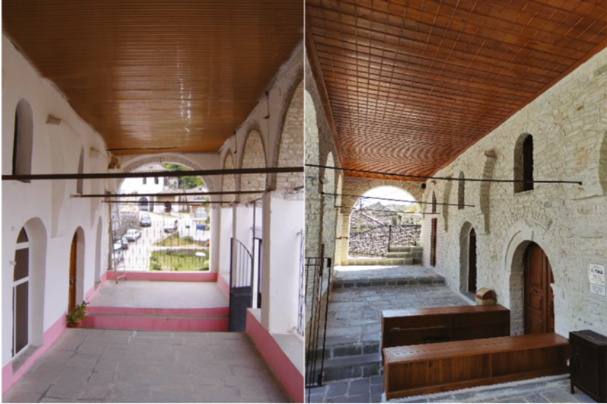
FIGURE 6.34 Last prayer hall in 2005 (left) and after restoration in 2021 (right-Merxhani)