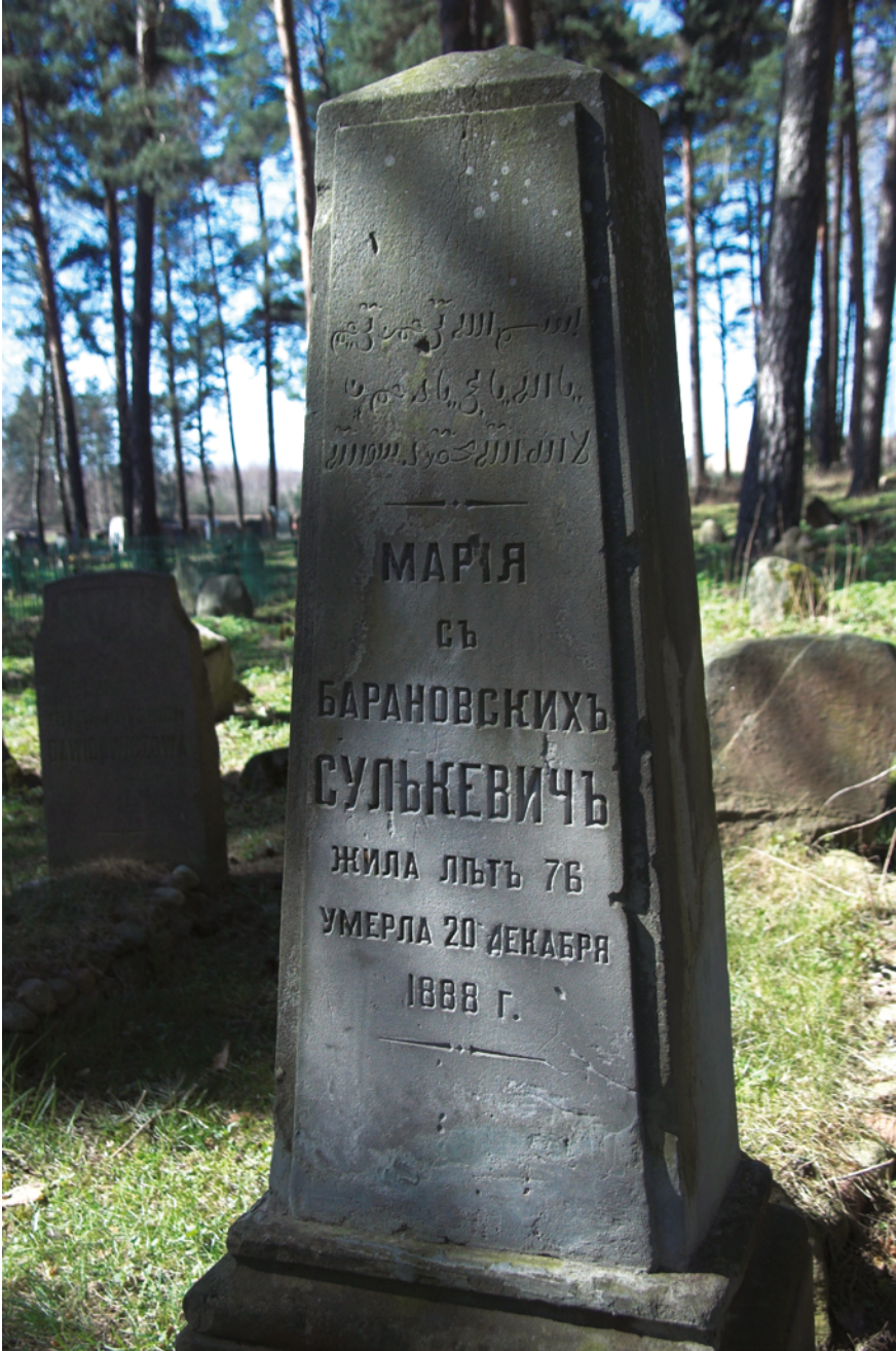
FIGURE 5.19 Bohoniki – Cyrillic script on gravestone NALBORCZYK