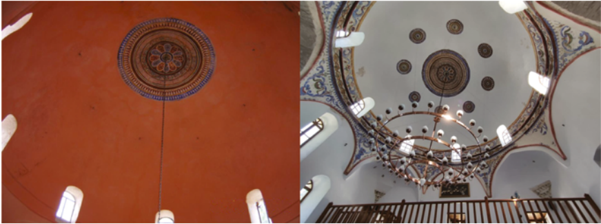
FIGURE 6.32 Inner Dome image in 2005 (left-Manahasa) and after restoration in 2021 (right-Merxhani)