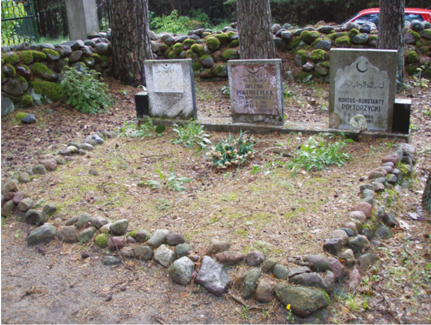
FIGURE 5.15 Kruszyniany – graves of Muslim Tatars (family Półtorzycki) NALBORCZYK