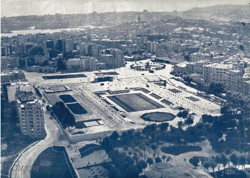
FIGURE 1.5 Gezi partly established after demolition of the military barracks