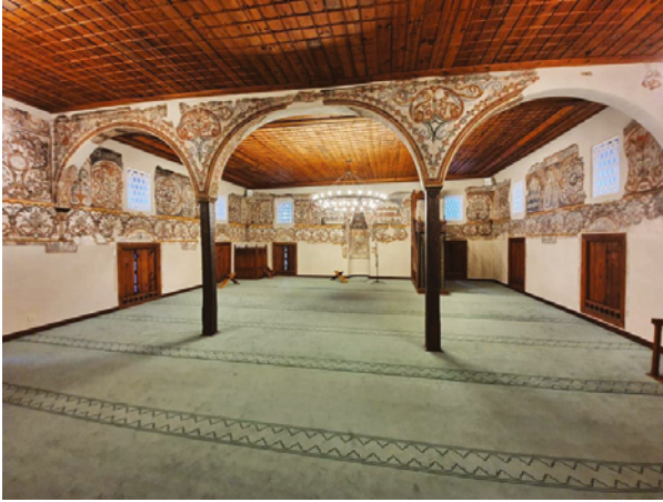
FIGURE 6.25 Main prayer hall after restoration