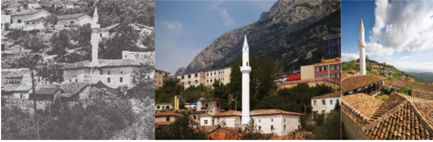
FIGURE 6.3 Murat Beg mosque in the 1960s before minaret was broken (left) and images after the 1990s before restoration (middle and right)