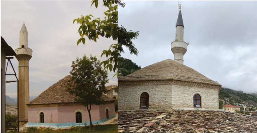
FIGURE 6.29 The stone slates on the dome in 2005 (left- Manahasa) and precisely rectangular stones on the dome after restoration (right-KMSH)