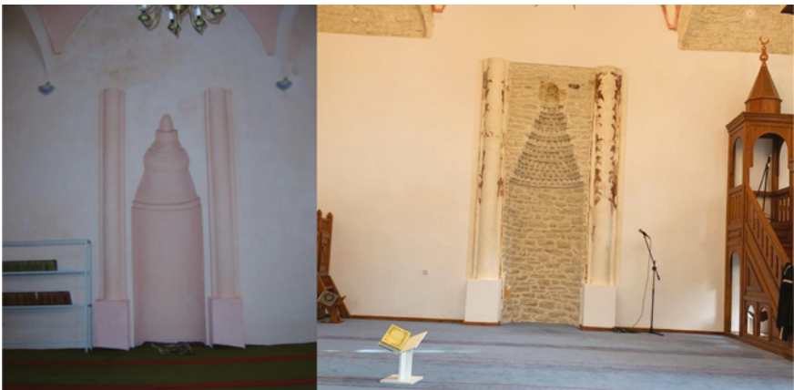
FIGURE 6.33 Mihrab of Mosque of Bazar in 2005 (right) and after restoration in 2021 (right-Merxhani)