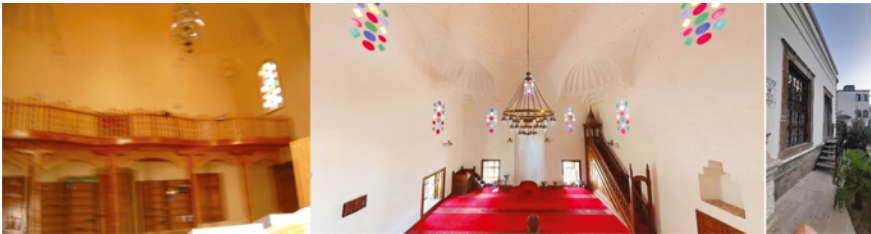
FIGURE 6.12 The women's mahfel in 2005 (left), main prayer hall interior after the restoration in 2018 (middle-Ministry of Culture of Albania) and iron stair added in entrance façade in 2021 (right-Manahasa)