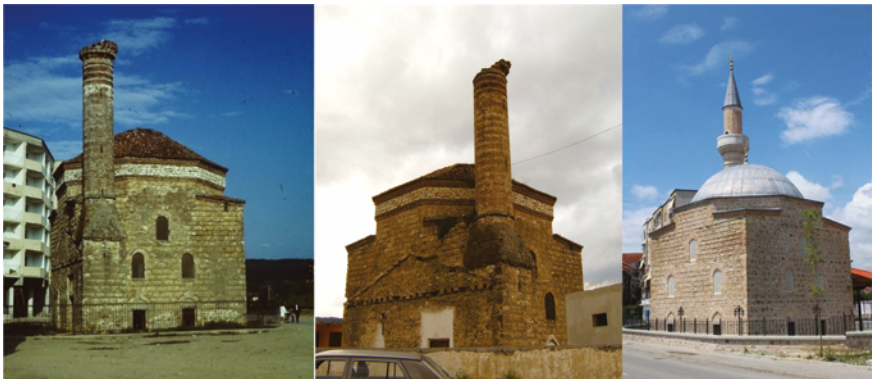
FIGURE 6.5 Image of Naziresha mosque in 1960s (Kiel-left), in 2005 (Manahasa-middle) and after restoration in 2020 (right)

The restoration works that started after 2012 included interventions in the exterior and interior of the mosque (Figure 6.5 – right). In addition, the minaret was completed, and the dome was renovated. We should say from the beginning that the restorative interventions in this building have been the most invasive ones. As seen from the comparison of the three images before and after the restoration, the drum of the dome and its covering material are not true to the original one. In the octagonal drum, which was composed of two different wall masonries, the upper white one was removed, consequently reducing the height of the drum, thereby negating the monumentality of the