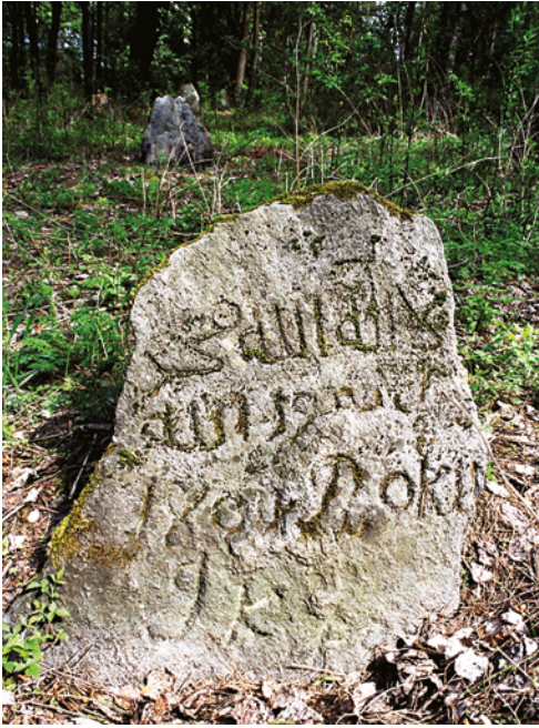
FIGURE 5.13 Kruszyńniany – grave of a Muslim Tatar (1804) NALBORCZYK