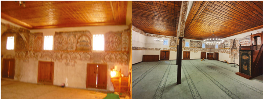
FIGURE 6.23 Inner image of north-east wall in 2005 (left) and after restoration in 2021 (right-KMSH)