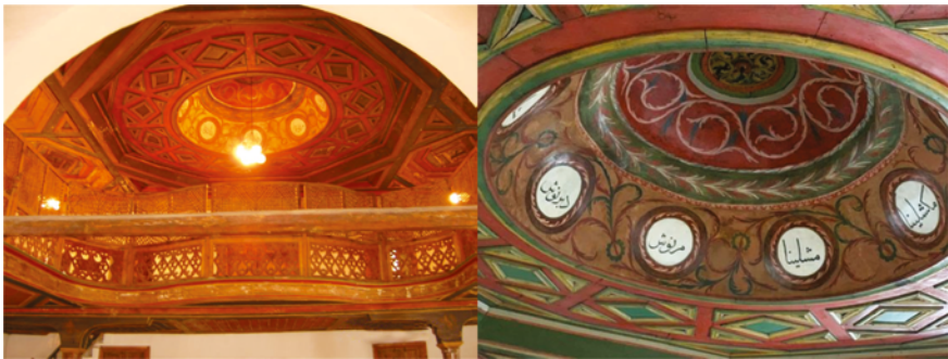
FIGURE 6.18 Wooden octagonal inner dome over women's mahfel in 2005 (Manahasa) and a closer image of the same dome after the restoration in 2021 (Ministry of Culture of Albania)

The paintings on the wooden domed ceiling of the mosque were also restored. Before restoration, the ceiling was predominantly reddish brownish, with greenish elements in a secondary presence. However, after restoration the green elements are much stronger, generating a more balanced, colourful composition (Figure 6.17). New chandeliers have been hung, whose new metallic fixture is circular and designed in a quatrefoil pattern, whose relation to Islamic symbolism remains unknown and unusual to the author (Figure 6.19). Apart from the restoration of the pulpit in the left corner of the qibla wall, the wooden quadratic ceiling in the last prayer hall has also been improved, although its colour changed from reddish brown to grey blue after restoration. On a positive note, the new roof tiles are similar to the original ones, and also respect the original colours. The roof eaves are clad with cherry-coloured wood panels in the lower part, the only change being the colour (Figure 6.14).