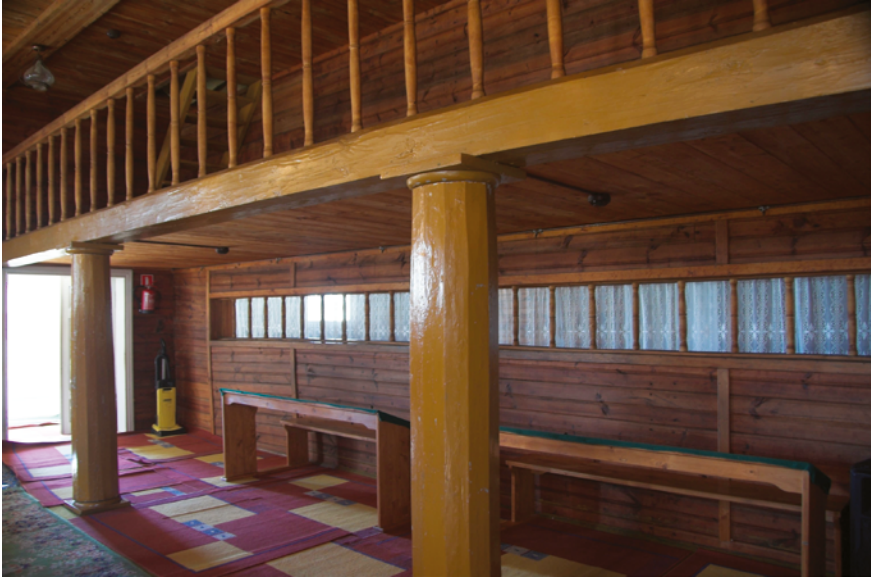
FIGURE 5.3 Kruszyń – the place for women – babiniec NALBORCZYK