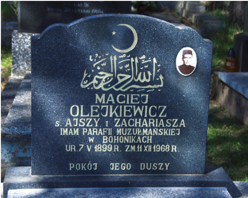
FIGURE 5.18 Bohoniki – grave of an imam of the Bohoniki mosque NALBORCZYK