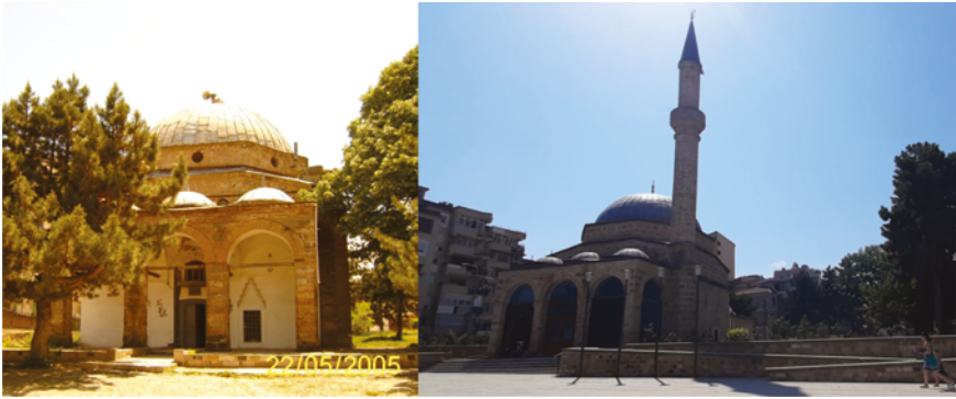
FIGURE 6.9 Entrance façade in 2005 and after the restoration in 2021 (Manahasa)