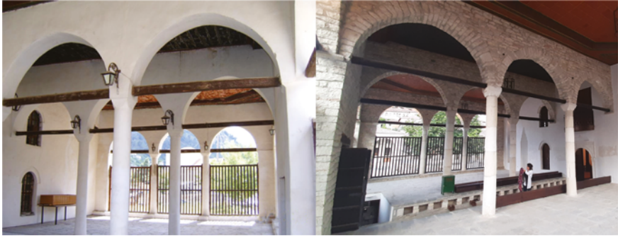
FIGURE 6.15 Last prayer hall arcade in 2005 (Manahasa) and last prayer hall after the restoration in 2021 (Manahasa)