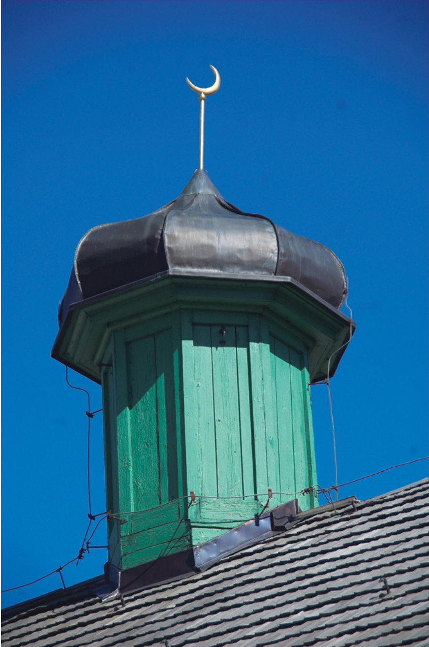
FIGURE 5.2 Kruszyniany – glorietta NALBORCZYK