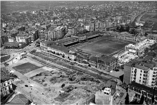
FIGURE 1.4 Taksim barracks before its demolition PHOTO FROM THE PUBLICATION “GÜZELLEŞEN İSTANBUL” DATED 1944, SHOWING THE TOPÇU MILITARY BARRACKS IN TAKSIM. THE BUILDING WAS DEMOLISHED IN 1940 AS PART OF THE URBAN PLAN OF HENRI PROST

the plans of French architect and city planner Henri Prost (Figure 1.4, 1.5, 1.6). It has since become a symbol of Turkey’s modernization and secularism. 17 In 2011, however, Erdoğan wanted to reverse the course of history. His party’s activists decided to rebuild the structure, despite the area falling within the purview of green space protection ordinances (Figure 1.7). The proposed rebuilt barracks were intended to be a shopping centre incorporating cultural