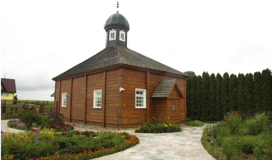
FIGURE 5.6 The mosque in Bohoniki (1873) NALBORCZYK