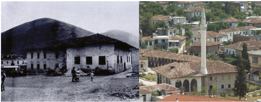
FIGURE 6.13 The image of the mosque of Bayezid II transformed into a store in 1978 (left-Kiel) and its image in 2005 (right)

The restoration of this mosque is part of the second agreement between İMK and TİKA which was conducted in 2018. The restoration process differs from the previous five mosques and was undertaken by Albanian specialists,