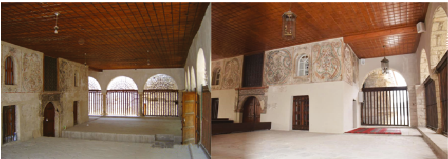
FIGURE 6.24 Last prayer hall in 2005 (left) and after restoration (right-KMSH)