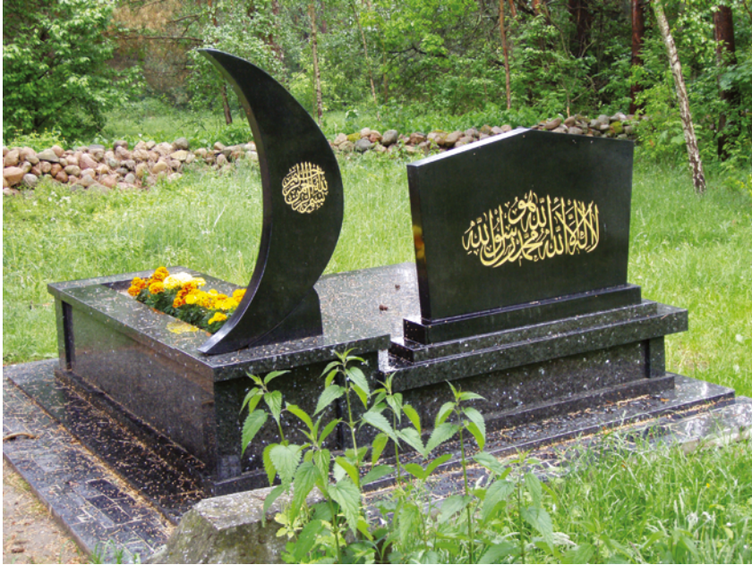
FIGURE 5.17 Kruszyniany – a modern grave of Muslim Tatars (family Safarewicz – 1999) NALBORCZYK