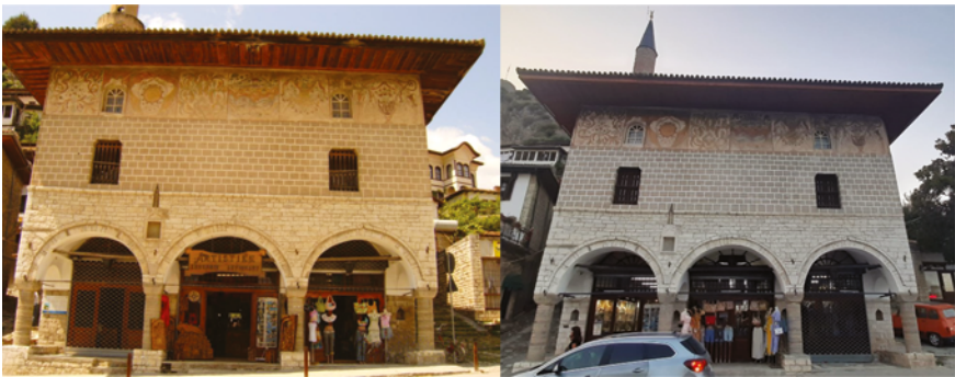
FIGURE 6.21 Qibla façade in 2005 (left) and the same after restoration in 2021 (right-Manahasa)

roof of the mosque. Apart from the replacement of old wooden structural elements, the roof was renovated using tiles of the same colour. The painting on the façades of the main prayer hall were also renovated (Figure 6.20 – right & Figure 6.21 – right).