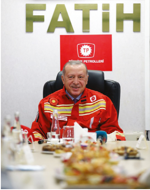
FIGURE 1.1 President Erdoğan during the conference held onboard the Fatih drillship “TURKISH PRESIDENT ANNOUNCES MORE GAS RESERVES IN BLACK SEA”. POST ONLINE MEDIA . JULY 5, 2021. HTTPS://WWW.POANDPO.COM /POLITICS/TURKISH-PRESIDENT-ANNOUNCES-MORE-GAS-RESERVES-IN-BLACK-SEA/

Mediterranean and Black Sea basins. Three drillships of the state-owned Turkish gas company were renamed after them (Figure 1.1). Their goal is to search for energy resources at sea. The first resources were discovered in 2020 by drillship Fatih in Black Sea. This policy led to significant tensions with the European Union and the United States. However, the Turkish president did not intend to give up his ambitious plans and his policy in this region is supported by the vast majority of Turkish society. According to a poll conducted in 2020, 75.4 percent support Turkey’s seismic research in the eastern Mediterranean. 13