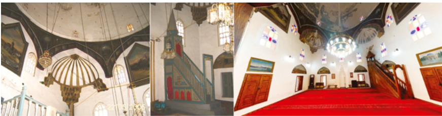
FIGURE 6.10 The squinches in the interior part in 2005 (left), the minbar (middle-Manahasa) and appearance after the restoration (2018-KMSH)

restoration, the fenestration consisted of two windows, one in the inner and the other in the outer part of the façade. After the restoration, the exterior window was removed and was substituted by classical Ottoman hexagonal honeycomb-like gypsum frames. Prior to the earthquake of 1961, in the octagonal drum there were windows framed by pointed arches, but in 2005 the windows are round. After the restoration, these windows were restored to the