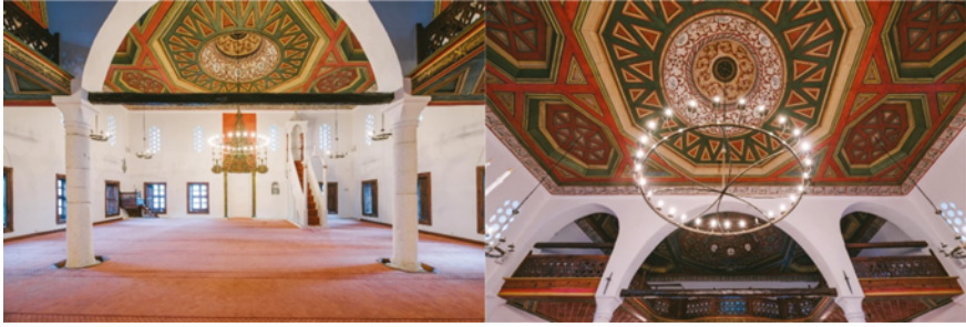
FIGURE 6.19 Image of harim (left) and women's mahfel (right) after the restoration in 2021