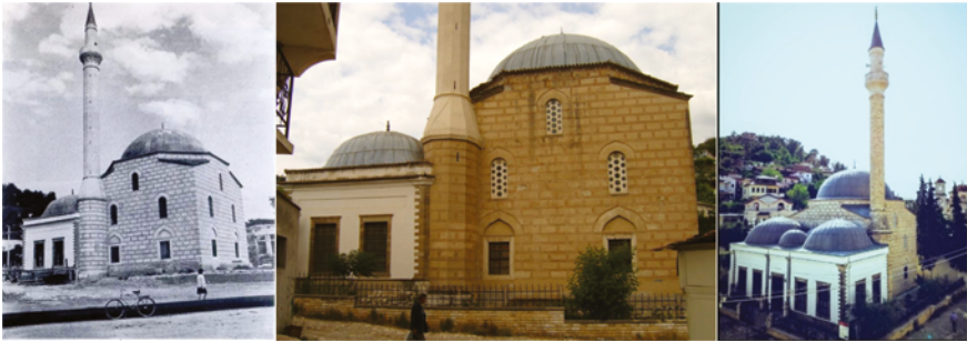
FIGURE 6. 11 Lead mosque after 1978 restoration (left-Dashi) and an image of main prayer hall in 2005 (center-Manahasa) and (right) after the restoration 2018 (KMSH)

The interior has been painted in a lighter colour compared to the previous yellowish tone, making the space more serene and noble (Figure 6.11 – left and right). However, the new minbar and the pulpit are ordinary, probably imported from Turkey. The gypsum window frames are decorated with stained glass in cyan, pink, and purple. The lighting chandeliers are the same as those used in the previous mosques, but we must say that here it stands out better, due to the inner space's height. Overall, the interventions in this building are appropriate and balanced.