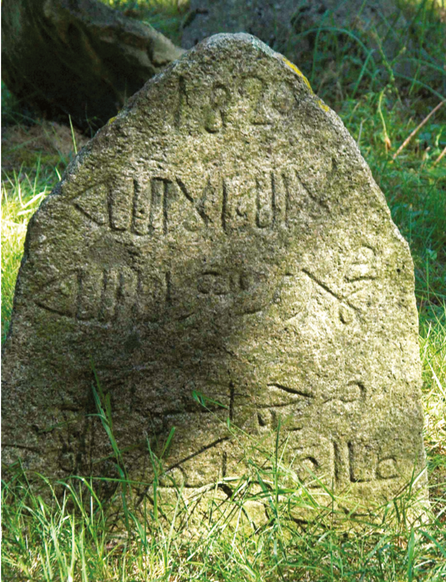
FIGURE 5.23 Studzianka – Muslim Tatar grave (Polish text in Arabic script – the name of the deceased ‘Aleksandrowicz’ – below Arabic religious inscription – 1820) NALBORCZYK