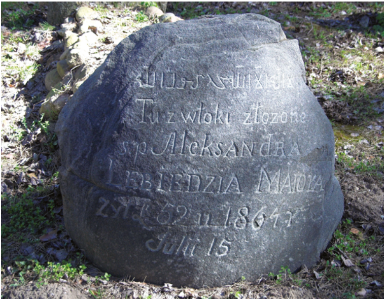
FIGURE 5.14 Kruszyńniany – grave of a Muslim Tatar in the rank of major (1864); Polish text below Arabic religious inscription NALBORCZYK