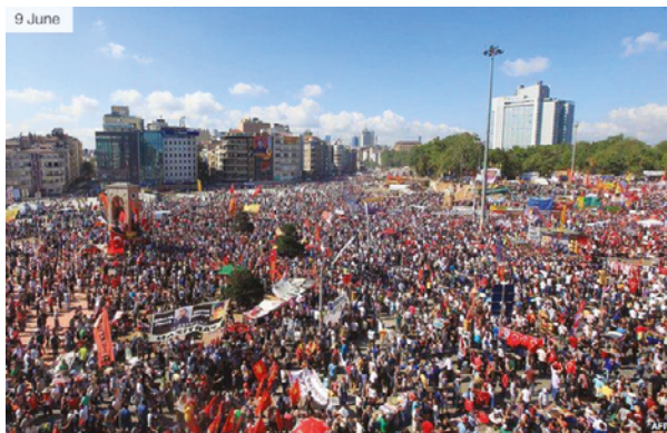
FIGURE 1.8 Gezi protests in Taksim square, 2013 "TURKEY GOVERNMENT FREEZES GEZI PARK PROJECT". BBC . JUNE 15, 2013. HTTPS://WWW.BBC.COM/NEWS/WORLD-EUROPE-22902308

centres, an opera house and a mosque. The project led to a protest from the people of Istanbul and turned into anti-government protests and riots across the country (Figure 1.8). Among their opponents were supporters of secular Turkey and other groups. The protests were brutally suppressed and the initiative to rebuild the barracks was discontinued. However, the Turkish president does not intend to abandon this initiative. In 2016, he stated: "One of the subjects that we have to be brave about is Gezi Park in Taksim. I am saying it