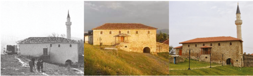
FIGURE 6.2 Image of the Mosque from 1971 (left), before restoration (middle) and after restoration (right)

space, conservation of the exterior and adjustments to the building interior. Overall, the restoration works are positive, except for some aspects which are the subject of discussion (Figure 6.2 – middle & right). In comparison to the original one, the new minaret looks as if it has been designed on the basis of classical Ottoman models, which are typical of centre of empire, Istanbul. In the original minaret, the part over the balcony and the conical cap are thinner than the lower part of its body, whereas the new one is all the same. The details in the şerefe (balcony) apparently reflect the İstanbul model. Although the original roof was tiled using hand-made local dark brown clay tiles, after the restoration the new tiles used are clearly manufactured and more reddish. After the restoration, the exterior looked more polished, and the rubble stone pattern more strongly emphasized.