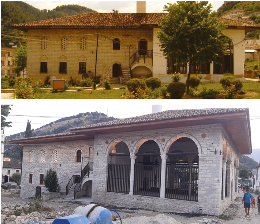
FIGURE 6.14 Northeast façade of mosque of Beyazit II in 2005 (top-Manahasa) and same image in 2021 (bottom-Manahasa)

among others Aleksander Meksi, one of the most important figures involved in historical Islamic architecture in Albania. Thus, the restorative interventions are more professional compared to the previously explained mosques, although some of them could be a subject of discussion. The restoration started in 2018 finished in February 2021 and included exterior masonry treatment and interventions in the interior space decoration. Prior to the restoration, the façades of the building were covered by a yellowish plaster, over which white rectangles are painted neatly (Figure 6.14 – left/Top). These rectangles give the impression of neatly cut blocks and are also recognizable in the image from 1978. After the restoration, the plaster was removed from the walls, except a smaller fragment, which was left at the northeast façade (Figure 6.15 – right). Thus, the new façade is left in bare masonry, polished, and treated from the structural point of view. This technique is also used in the arcade of the last prayer hall and in the piers of the main prayer hall which also had their plaster removed (Figure 6.15 – left & right).