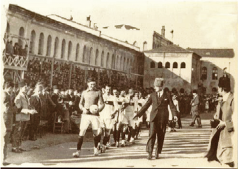
FIGURE 1.3 The first football stadium in Turkey established in the Taksim barracks “Taksim Stadium” WIKIWAND. 2020. HTTPS://WWW .WIKIWAND.COM/EN/TAKSIM _STADIUM