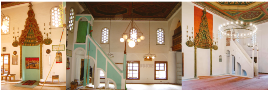
FIGURE 6.16 Mihrab and minbar with southwestern inner façade in 2005 (left and middle-Manahasa) and after the restoration in 2021 (Ministry of Culture of Albania)