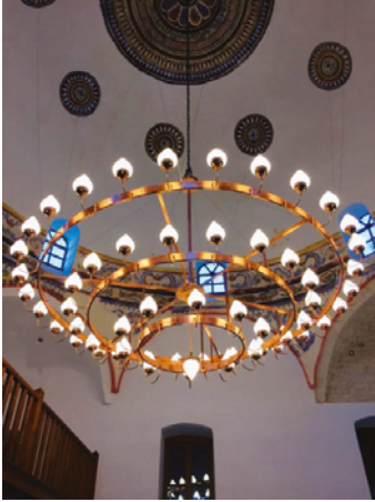
FIGURE 6.31 Painting decorations at the transitional part between squinches and dome after restoration in 2021 (KMSH)