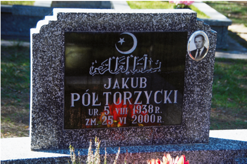
FIGURE 5.16 Kruszyniany – grave of a Muslim Tatar NALBORCZYK