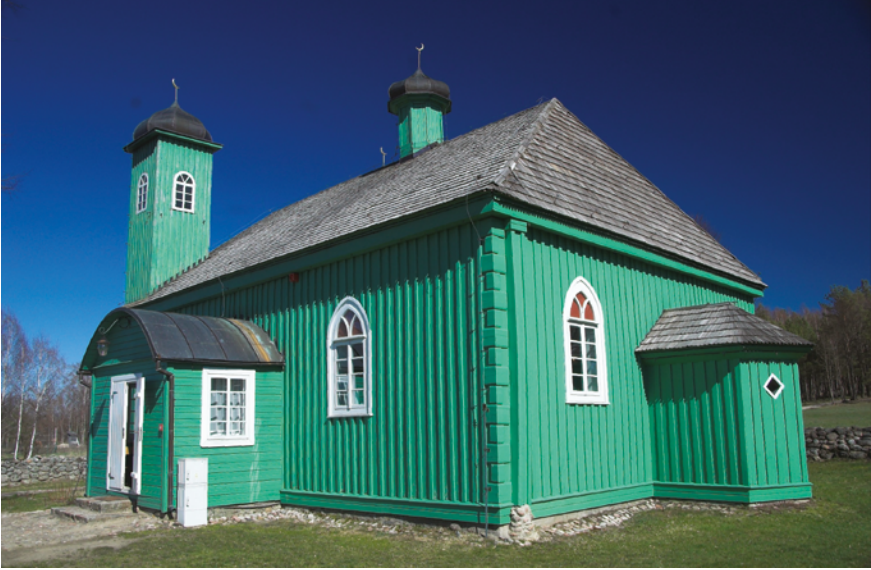
FIGURE 5.1 Mosque in Kruszyniany (1799) ENTRANCE TO THE MEN'S PART AND MIHRAB ON THE RIGHT (NALBORCZYK)