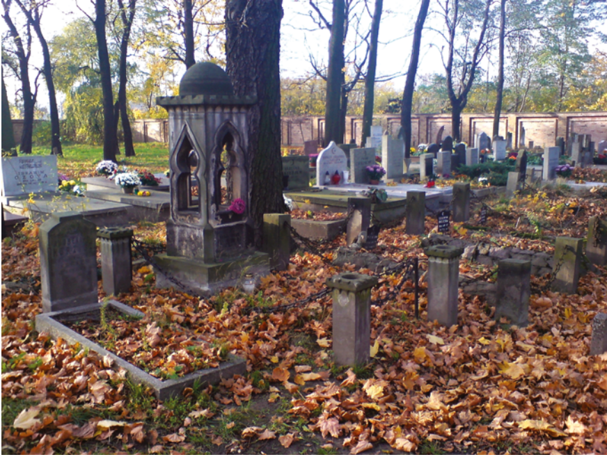
FIGURE 5.9 The Tatar Cemetery in Warsaw – graves of Polish Tatars (20th century) NALBORCZYK