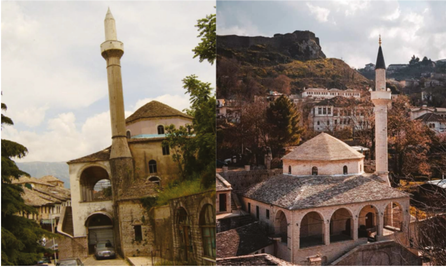
FIGURE 6.27 Image of Mosque of Bazar in Gjirokastra in 2005 (left) and after restoration 2021 (right)