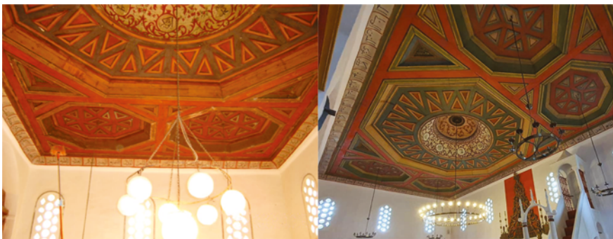
FIGURE 6.17 Minor lateral octagonal domes and major wooden domes in 2005 (Manahasa) and after the restoration in 2021 (Ministry of Culture of Albania)