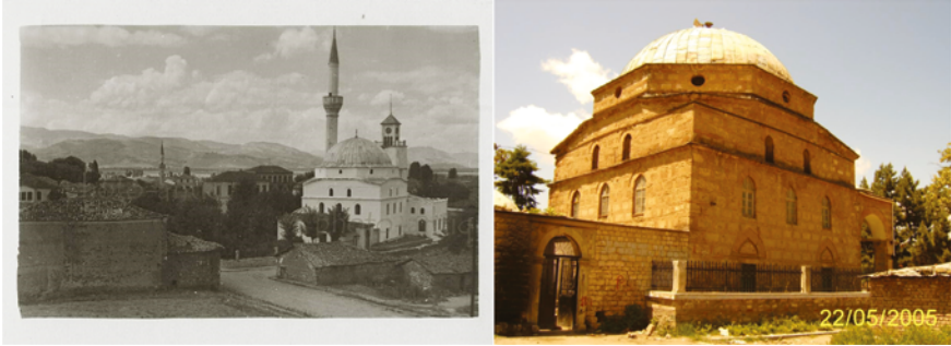
FIGURE 6.8 Image of Mirahor İlyas Beg Mosque before the second World War (left-) and in 2005 (right-Manahasa)