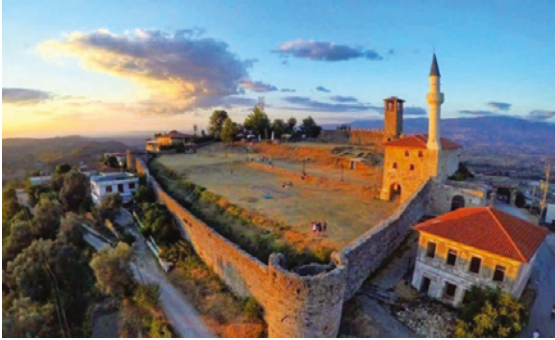
FIGURE 6.1 Actual image of Preza castle and Mosque after late restoration