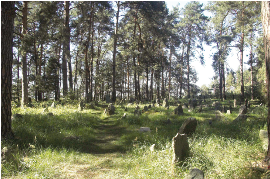
FIGURE 5.21 Mazar in Studzianka (closed) NALBORCZYK