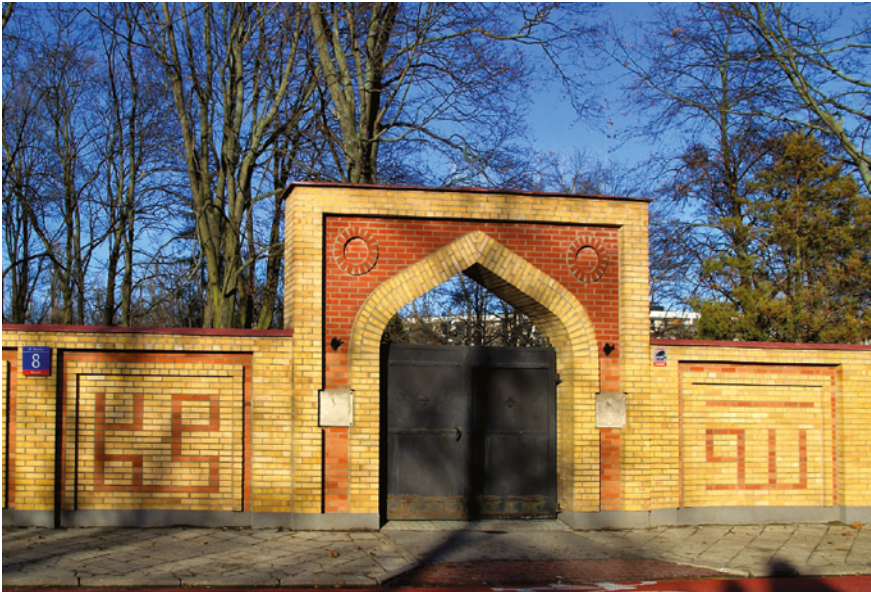
FIGURE 5.8 The Tatar Cemetery in Warsaw (est. 1867) – main gate NALBORCZYK