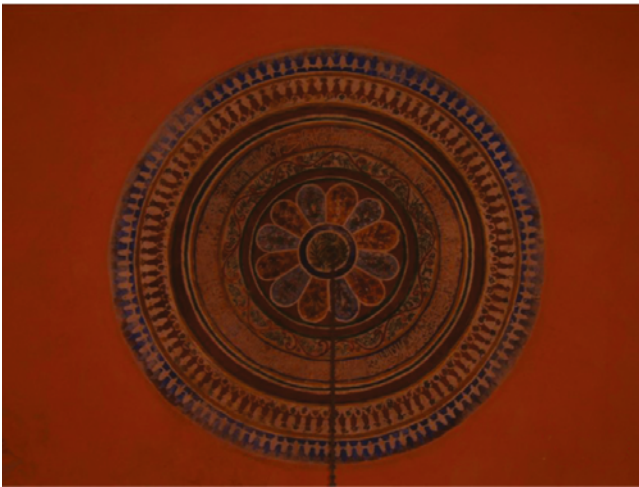
FIGURE 6.30 Medallion at the centre of the dome with central floral motif, and olive leaves and tulip motifs in the outer ring

The interior of the main prayer hall was also restored. The mihrab plaster was removed and left bare (Figure 6.33). Oddly, the same technique was used for the squinches in the transitional parts of the dome. When the author visited the mosque in 2005 the dome was painted in a light reddish colour and the original decorations were covered over, apart from a circular medallion which was left uncovered (Figure 6.30). After restoration, the dome and the interior were painted white, and eight smaller circular medallion motifs were uncovered (Figure 6.31 and Figure 6.32). The triangular surfaces created in the transitional part between the dome and the squinches were also uncovered by removing the plaster and being repainted.