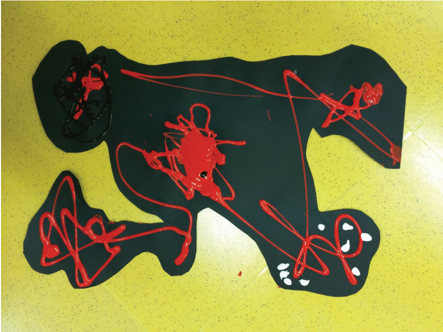
FIGURE 12.1 Federico's river of learning, Bicocca, 13/02/2015 (from Del Negro, 2018, p. 132)

clump indeed. Infernal skein that makes us suffocate, that eats my oesophagus.