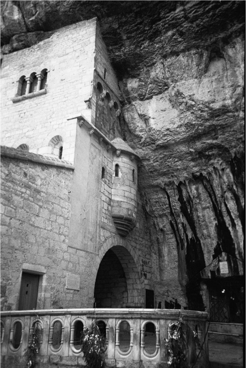
Figure 2. St. Michel Chapel at Rocamadour, showing the architectural placement of the buildings against the cliff wall.