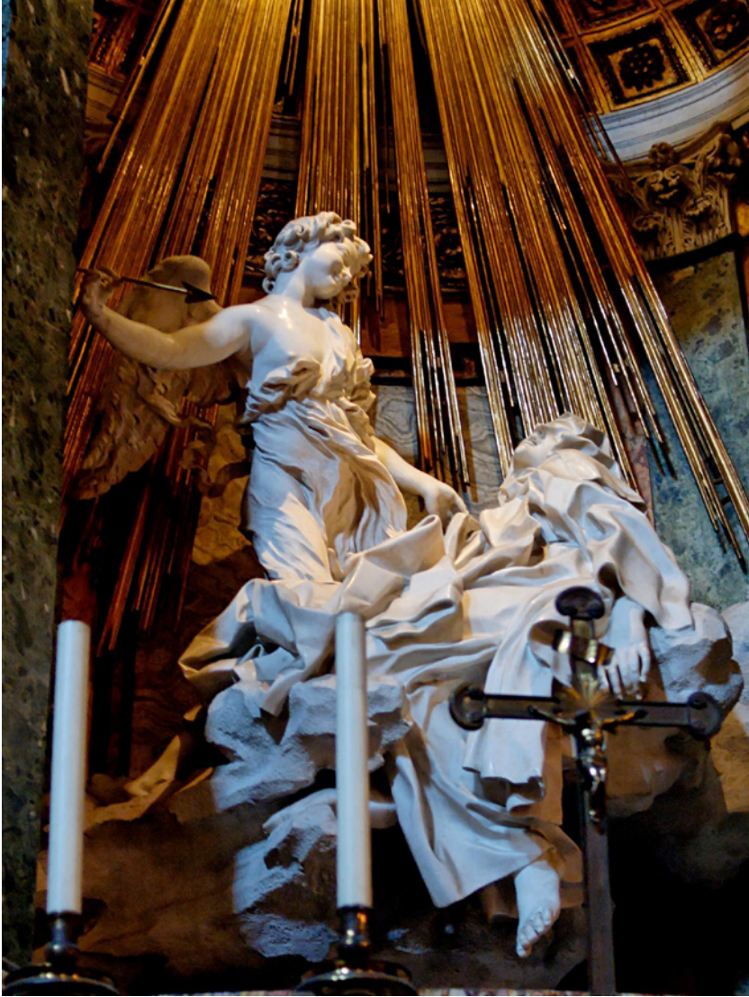
Figure 2. Bernini's statue of the Spanish mystic, Santa Teresa, remains a classic illustration of mystical ecstasy.