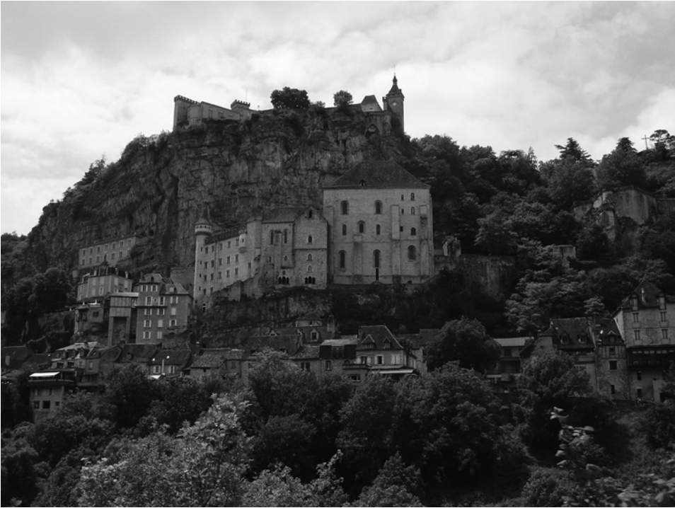
Figure 1. View of Rocamadour from across the Alzou Canyon.

as their fourth wall. The effect is spectacular from an architectural perspective, but also as a testament of faith and as a feat of construction that somehow manages to incorporate these buildings into the natural landscape. The beauty of Rocamadour has almost certainly attracted more people than its pilgrimage, and over the twentieth century, theme parks and attractions of various kinds appeared in the vicinity, taking advantage of and contributing to the flow of tourists, up to 1.5 million annually.