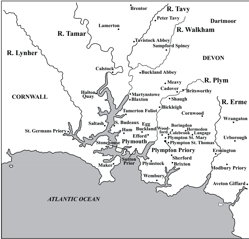
Map 2. Plympton and its Environs.