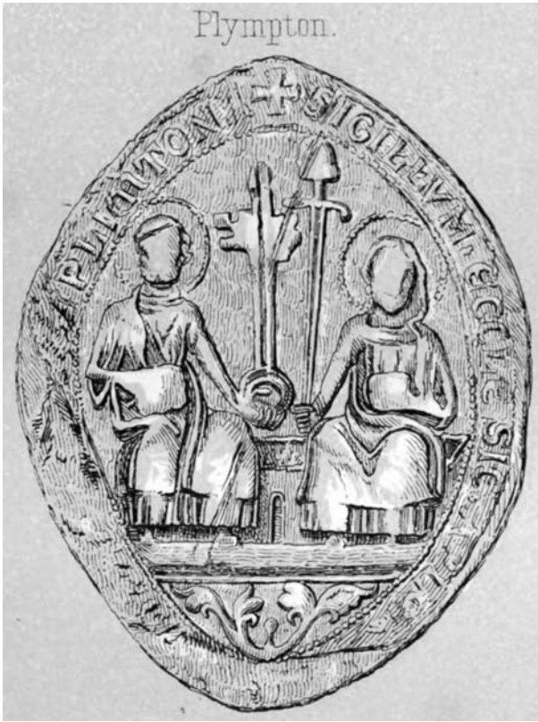
Fig. 1. The Seal of the Priory of SS. Peter and Paul, Plympton, Devon.