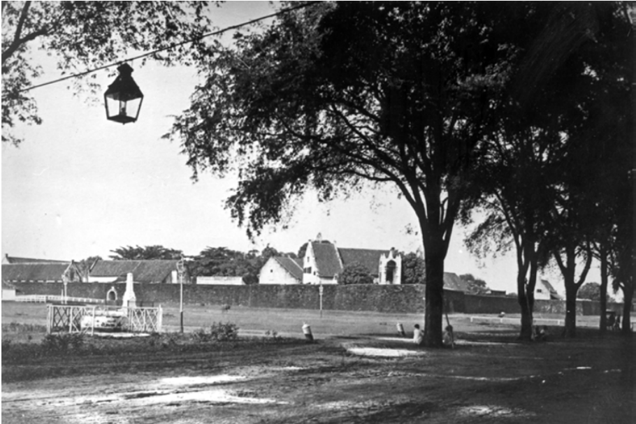
Plate 80. A view of Fort Rotterdam, Makassar looking towards the north-east bastion (Bastion Mandarsaha), probably taken in the late nineteenth century. The building which housed Dipanagara and his family is the second from the left immediately behind 'landward' gate ( landpoort ). The tall building over the wall in the foreground housed the guardhouse and powder-magazine of the Bastion Mandarsaha.

its 69 degree Fahrenheit mean early morning temperature as too cold (note 201), no leap of the imagination is necessary to contemplate how many Dutch winters he would have survived in the damp fortresses of the Netherlands 'water line' frontier defence system. 239 It was fortunate for the prince that the Dutch king rejected Van den Bosch's proposal out of hand as politically unacceptable. 240 Indeed, it would not be until the early twentieth century that