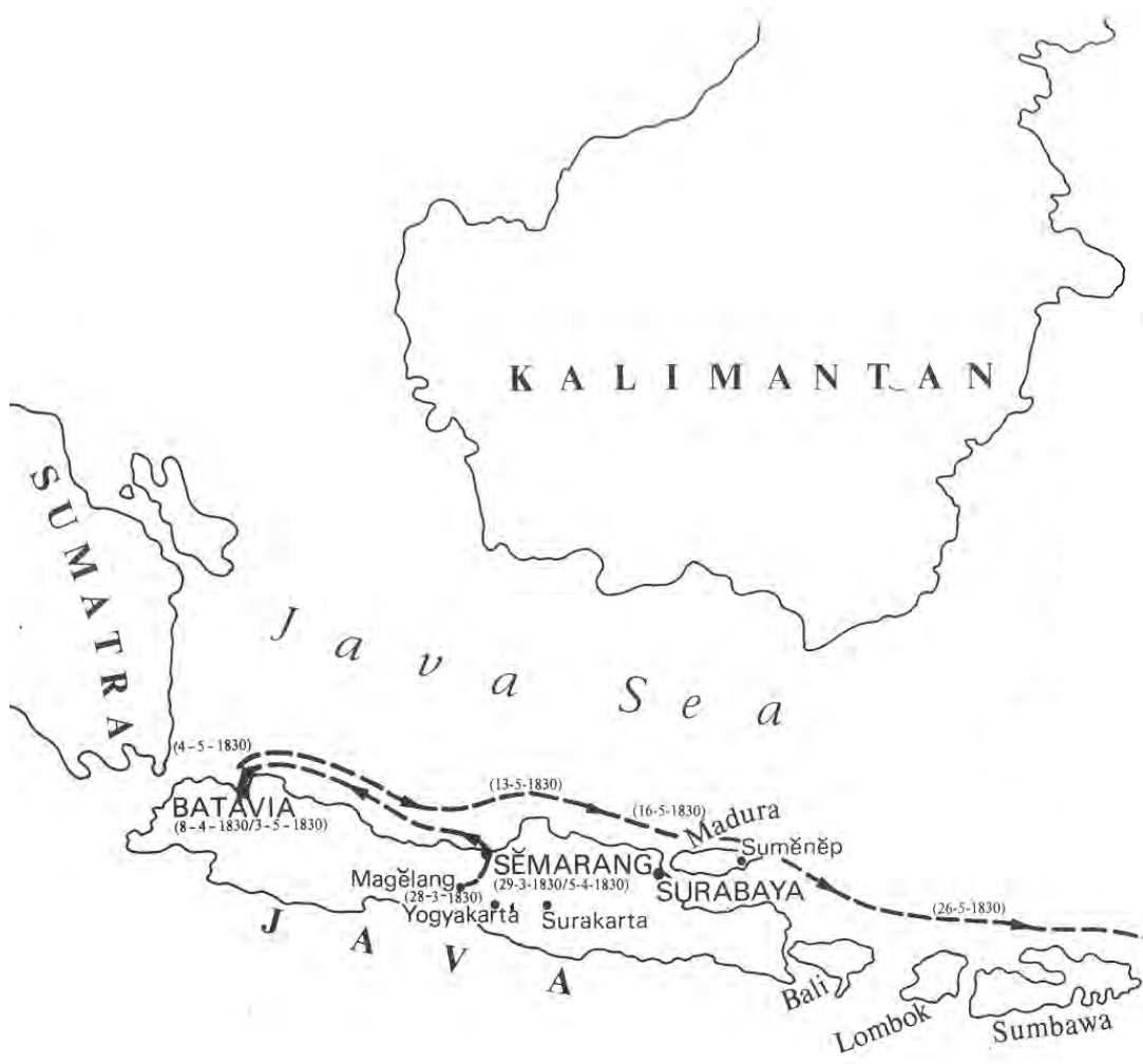
Map 6. Dipanagara's journey into exile in Manado (1830-1833) on the corvette Pollux (4-5-1830 – (20-6-1833 – 11-7-1833.