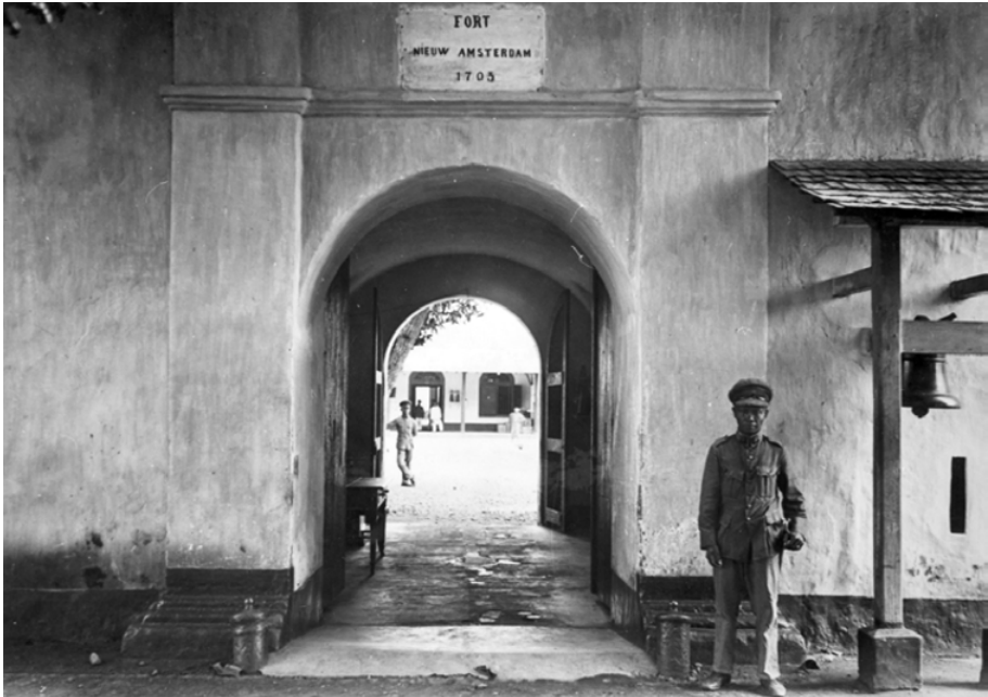
Plate 78. 'Fort Nieuw Amsterdam', Manado (completed in 1705) where Dipanagara was kept between June 1830 and June 1833. The Resident's house in which he had his accommodation can be seen through the open gateway. The fort was later destroyed by American bombing (circa 1944). Photograph probably taken in the 1930s.