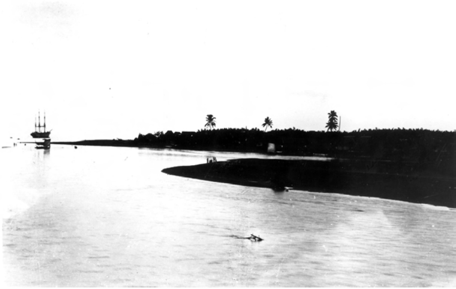
Plate 77. The bay of Manado with a three masted schooner (probably a mail boat) anchored off the town. Photograph taken between 1860 and 1870, perhaps by Woodbury and Page. Courtesy of the KITLV, Leiden.

figured Multatuli's views in his concluding letter to Van den Bosch on his arrival back in Java: