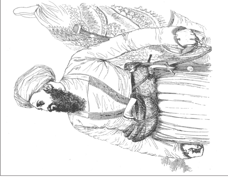
Amir Dost Mohammad Khan (1791–1863).