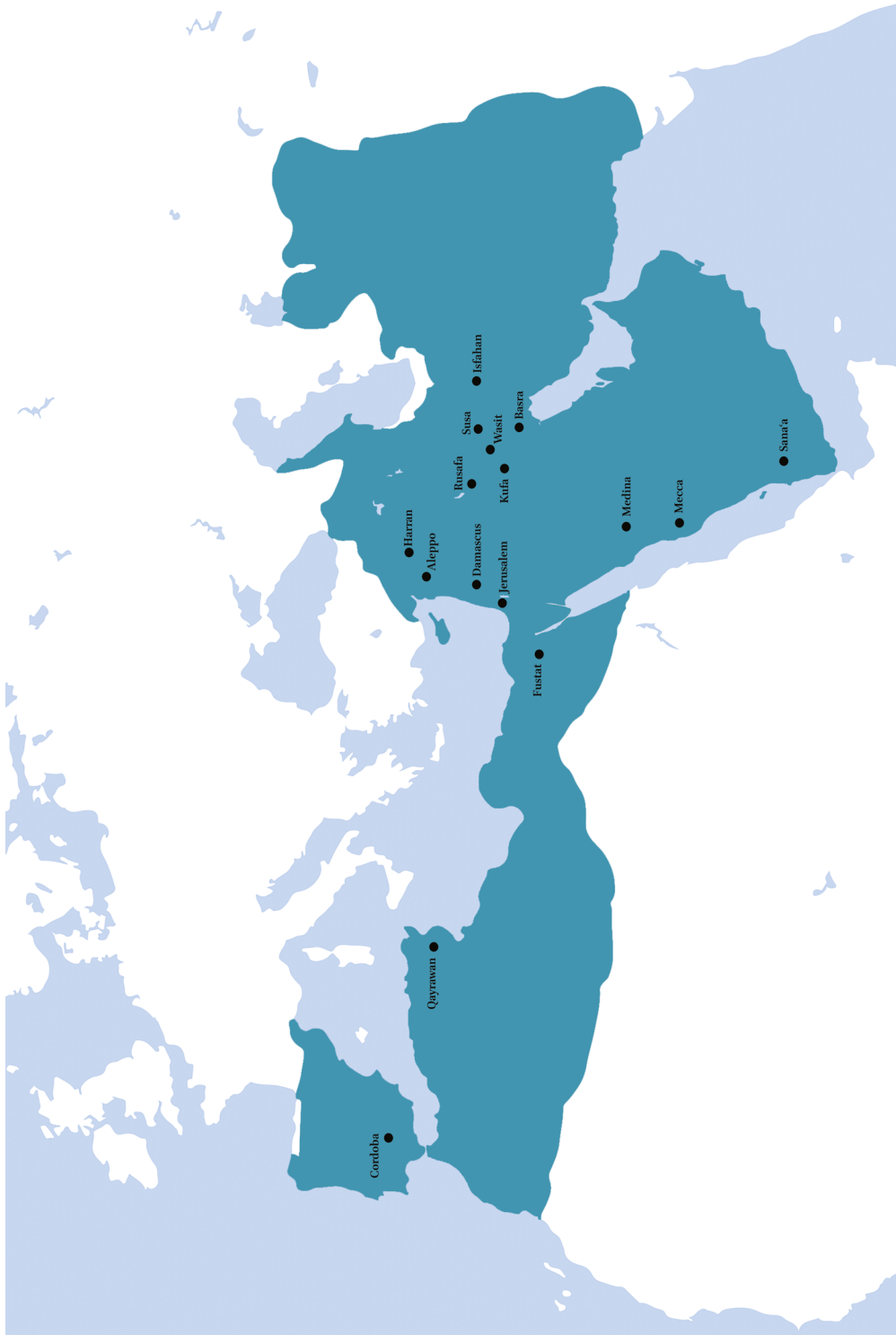
PLATE 1 Map of the Umayyad Empire indicating locations of Umayyad mosques DRAWN BY REHAM SHADI