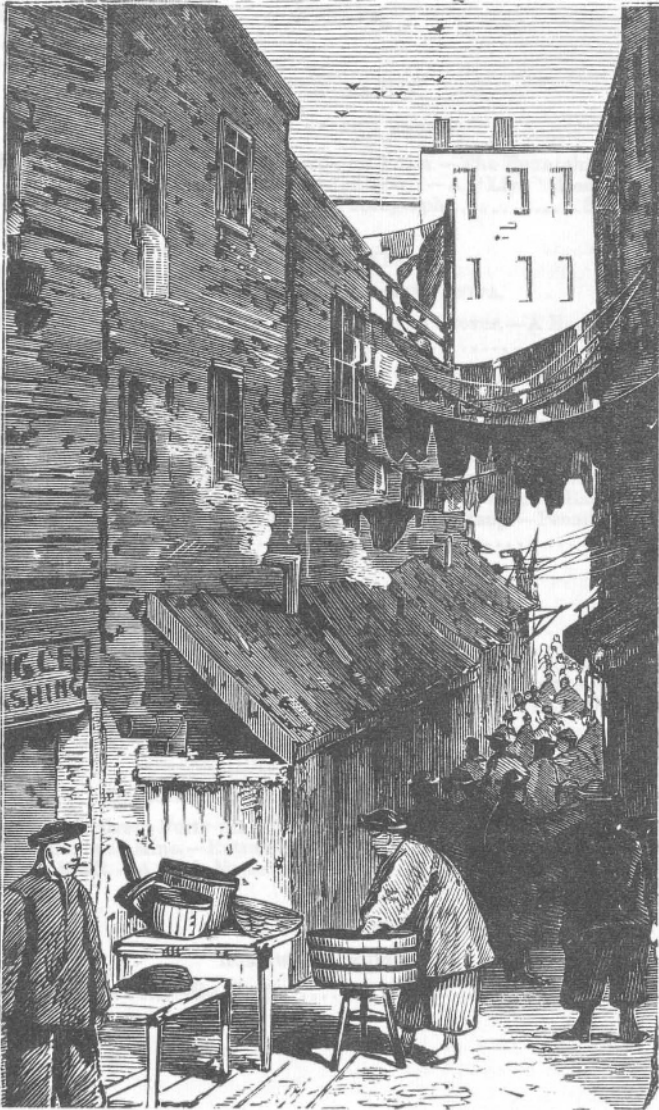
STREET IN THE CHINESE QUARTER, SAN FRANCISCO. Page 144.