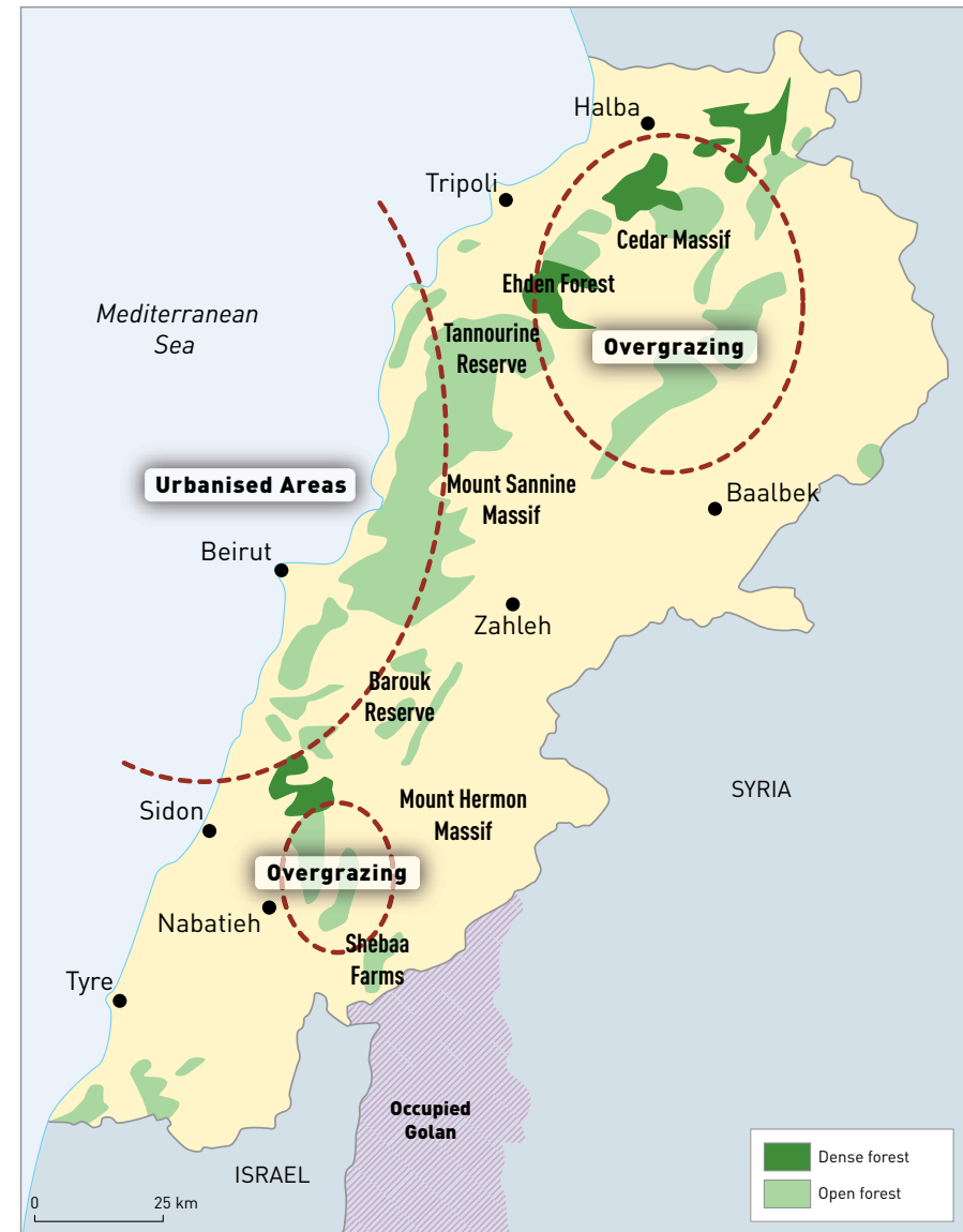
Based on: Atlas du Liban , CNRS Lebanon, 2004.